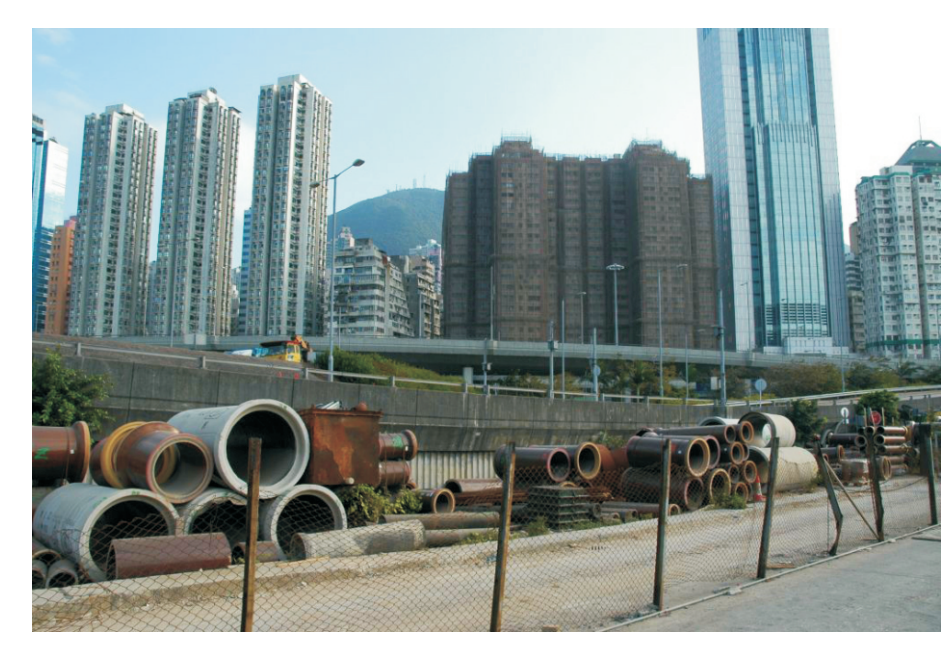
LCA2.3 Mix-Use Urban Fringe Landscape (Sai Ying Pun)