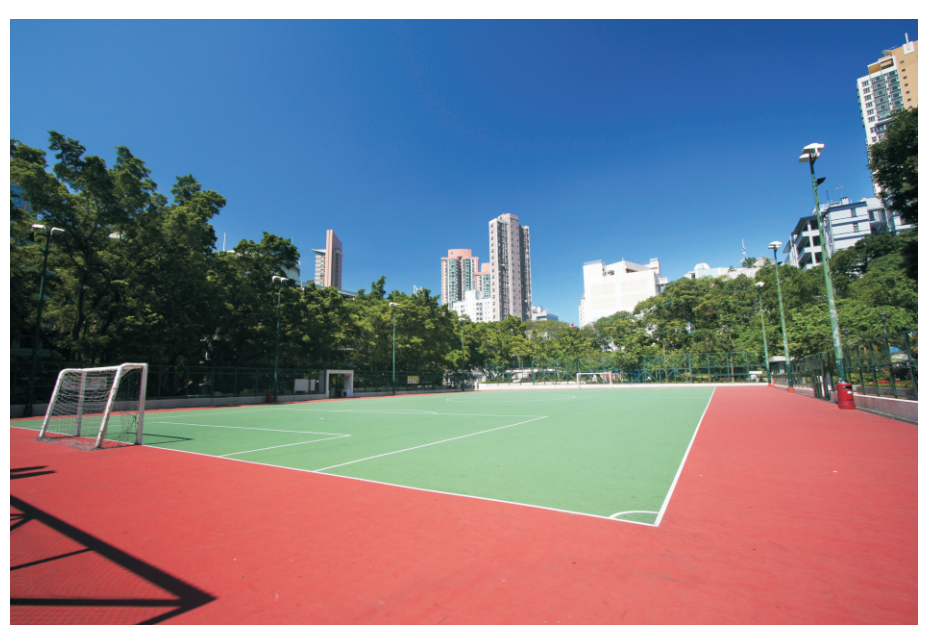
LCA3.3 Open Institutional Landscape (Sai Ying Pun)