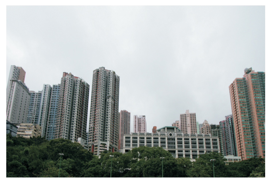
LR6.3 Residential Urban Fringe Landscape (Sai Ying Pun)